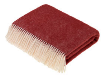
HARRINGWORTH RED Lambswool