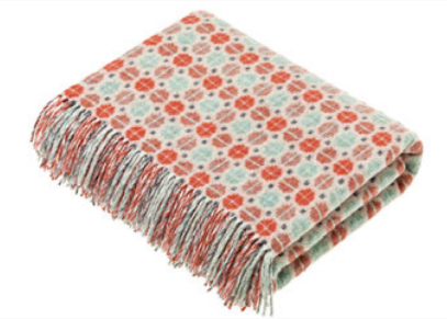
MURANO ORANGE CORAL MINT Lambswool