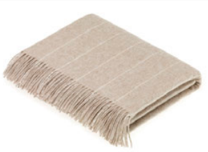
PRESTON BEIGE Lambswool