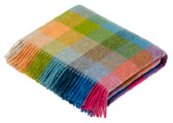
HASTINGS TUTTI FRUTTI Shetland