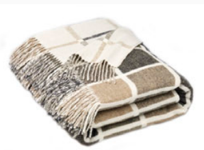
MARLOW NATURAL Lambswool