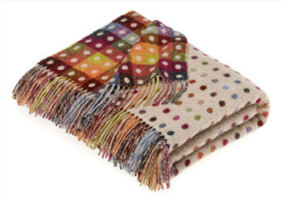
MOIRA BEIGE MULTI Lambswool