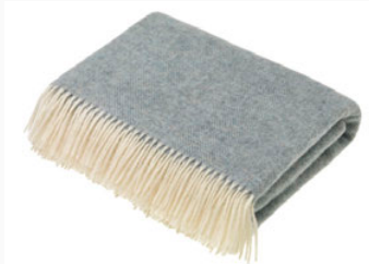
HARRINGWORTH DUCK EGG Lambswool