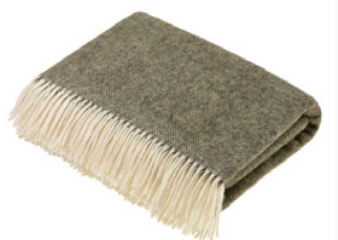
HARRINGWORTH VINTAGE GREY Lambswool