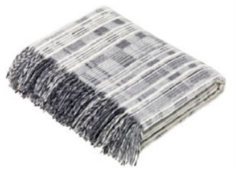
MILLBROOK GREY Lambswool