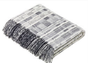
MILLBROOK GREY Lambswool