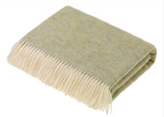
HARRINGWORTH LIGHT SAGE Lambswool