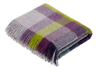
HARTLEY BLACKCURRANT Shetland