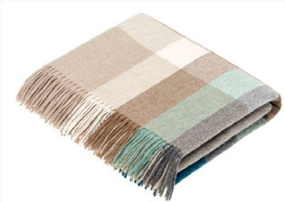
HARTLEY EUCALYPTUS Lambswool