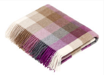
HASTINGS CLOVER Lambswool