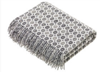
MURANO GREY Lambswool