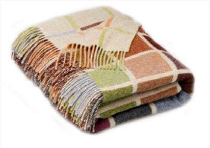
MARLOW BEIGE MULTI Lambswool