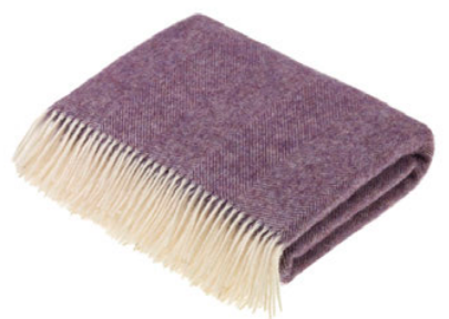
HARRINGWORTH LAVENDER Lambswool