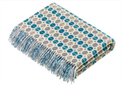
MURANO EUCALYPTUS Lambswool

Eucalyptus is a tropical, yet natural color with an ever-rising popularity in luxury interior design. Mixing both bold & heathered shades, our eucalyptus throws are available in a variety of check, stripe and semi-plain patterns.