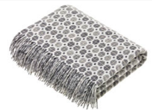
MURANO GREY Lambswool