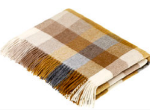
HASTINGS GOLD Lambswool