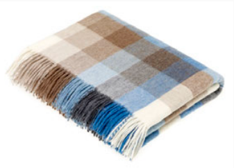
HASTINGS AQUA CAMEL Lambswool