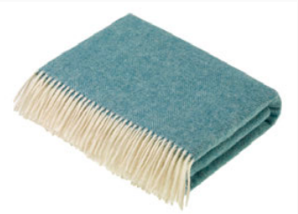
HARRINGWORTH AQUA Shetland