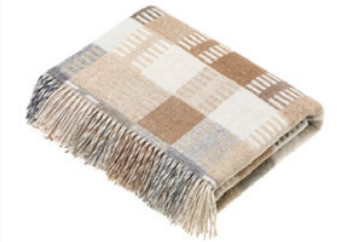
VERWOOD NATURAL Lambswool