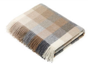
HASTINGS NATURAL Lambswool