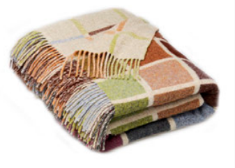
MARLOW BEIGE MULTI Lambswool