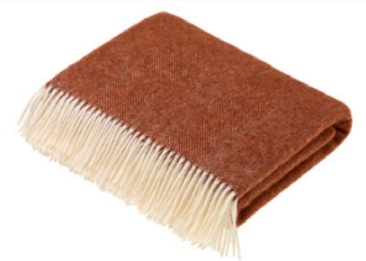
HARRINGWORTH BRICK Lambswool