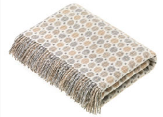
MURANO NATURAL Lambswool