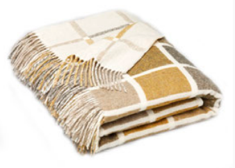
MARLOW MUSTARD Lambswool