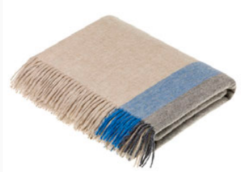
HARTLEY AQUA CAMEL Lambswool