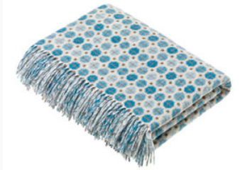
MURANO SKYE AQUA Lambswool