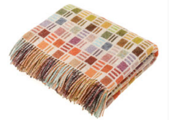
ROCHESTER BEIGE MULTI Lambswool