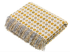
MURANO GOLD Lambswool