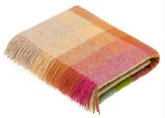
HARTLEY SUNSHINE Shetland