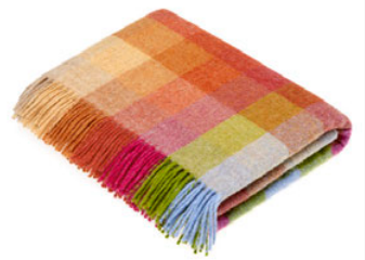
HASTINGS SUNSHINE Shetland