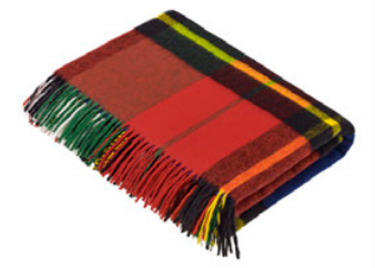
MANCHESTER TARTAN Lambswool