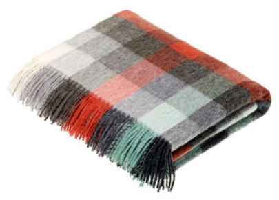
HASTINGS CORAL MINT Lambswool