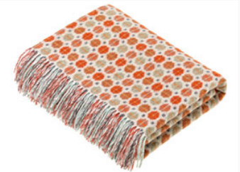
MURANO SAFFRON Lambswool