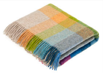
HARTLEY TUTTI FRUTTI Shetland