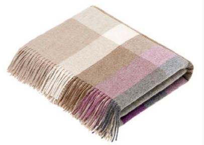
HARTLEY CLOVER Lambswool