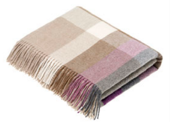
HARTLEY CLOVER Lambswool