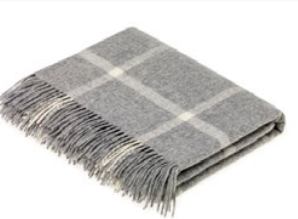
WELLINGTON GREY Lambswool