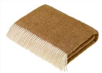
HARRINGWORTH GOLD Lambswool