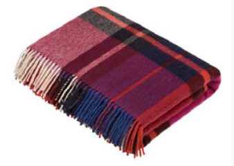
MANCHESTER MULBERRY Lambswool