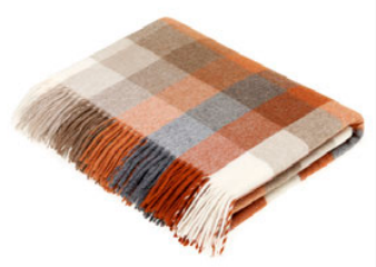
HASTINGS SAFFRON Lambswool