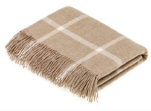
WELLINGTON BEIGE Lambswool