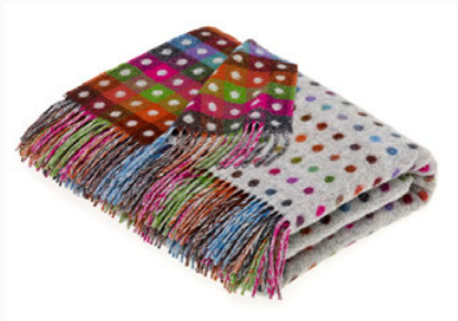
MOIRA GREY MULTI Lambswool