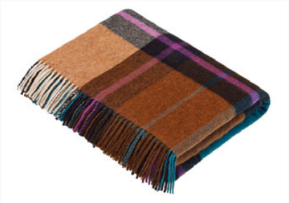
MANCHESTER TEAL Lambswool