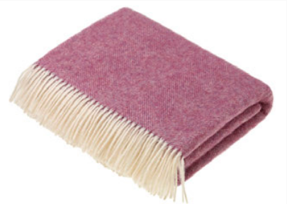
HARRINGWORTH PINK Shetland