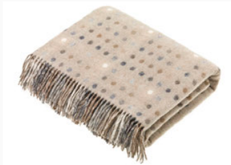
MOIRA NATURAL Lambswool