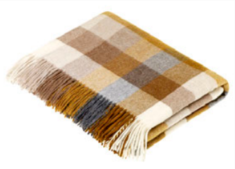
HASTINGS GOLD Lambswool