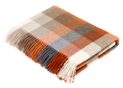
HASTINGS SAFFRON Lambswool