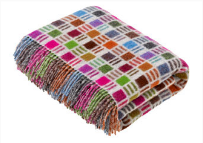
ROCHESTER MULTI GREY Lambswool