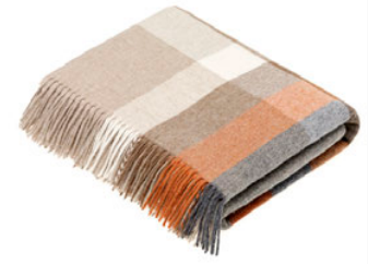
HARTLEY SAFFRON Lambswool