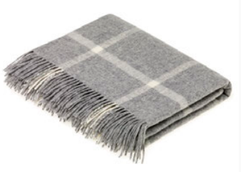
WELLINGTON GREY Lambswool