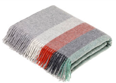
HARTLEY CORAL MINT Lambswool

Add a splash of springtime color with a trend-inspired combination of coral and mint. Designed in the bold checks and stripes of Hastings and Hartley, the collection is well rounded off with cleverly crafted Harringworth and Murano patterns.