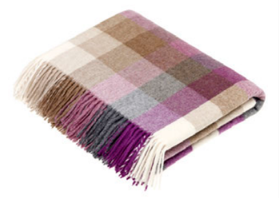
HASTINGS CLOVER Lambswool