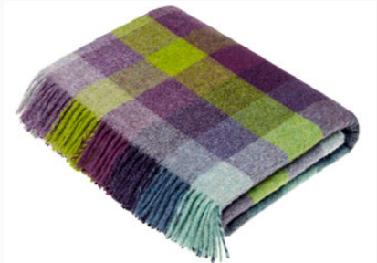
HASTINGS BLACKCURRANT Lambswool