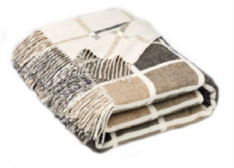
MARLOW NATURAL Lambswool