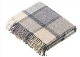
BRISTOL WHITE BEIGE Lambswool