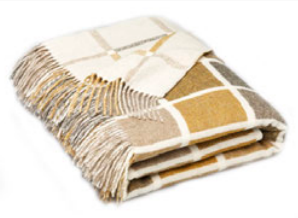
MARLOW MUSTARD Lambswool