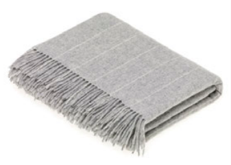
PRESTON GREY Lambswool