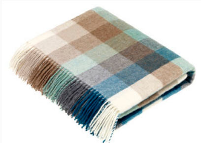
HASTINGS EUCALYPTUS Lambswool