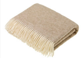
HARRINGWORTH NATURAL Lambswool