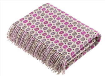
MURANO CLOVER Lambswool