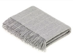
PRESTON GREY Lambswool