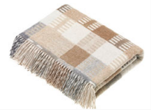
VERWOOD NATURAL Lambswool