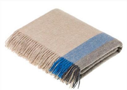
HARTLEY AQUA CAMEL Lambswool