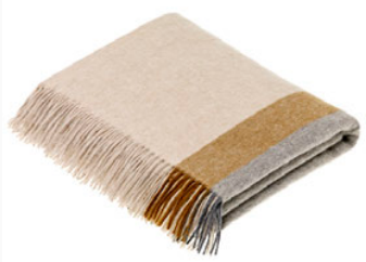
HARTLEY GOLD GREY Lambswool