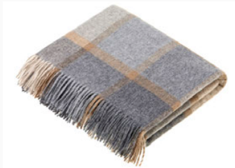
BRISTOL GREY BEIGE Lambswool